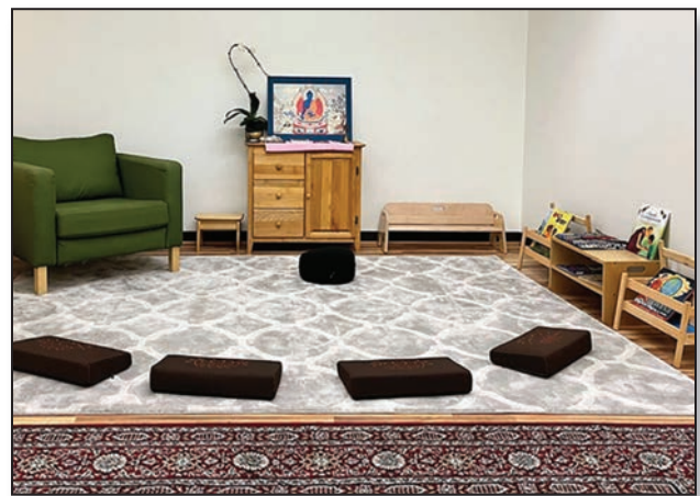
Good Heart Education area