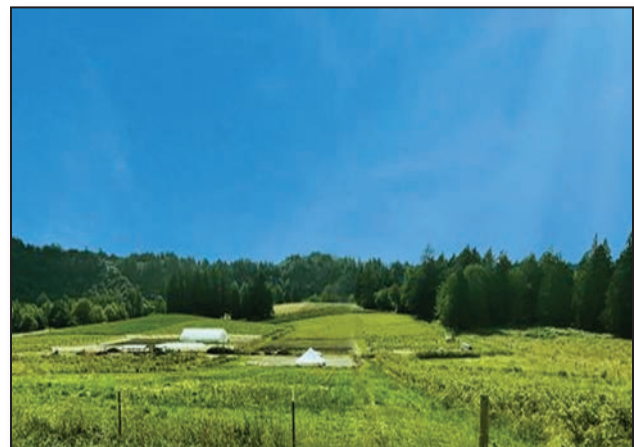
Tara Farms, the location of the project