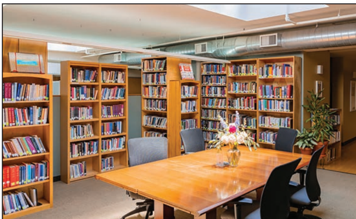
James A. Blumenthal Library (JABL) new space