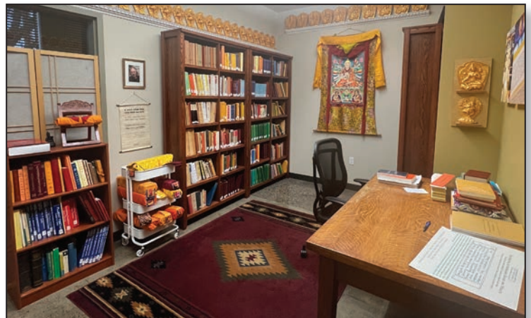
The new Tibetan Language Center on the first floor houses Tibetan and Sanskrit texts, and offers students a dedicated space for translation work, language studies, small group work, and quiet study.