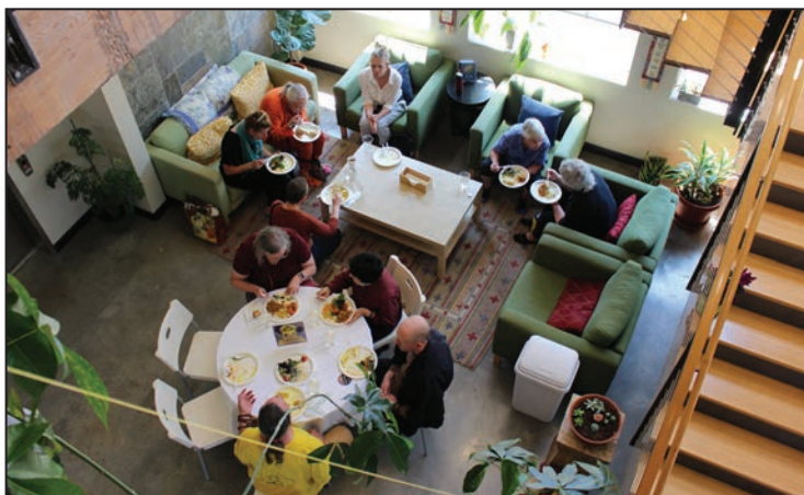
Students and community members now have several new options of inviting spaces to gather for conversation and meal breaks during classes and public events.