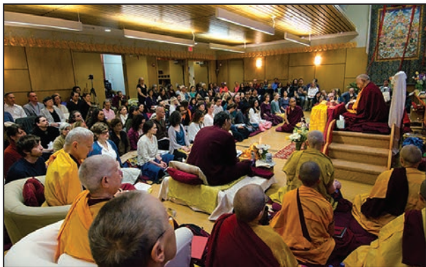
Public Teaching in the Jokhang (2019)