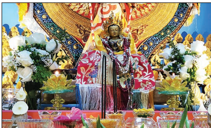
Tara offerings during regular retreats and practices this year.