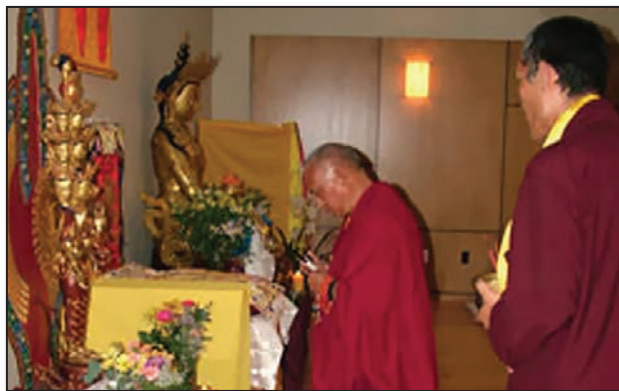
Blessing the new Jokhang Meditation Hall (2006)