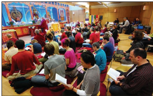
Teaching in the Jokhang (2007)