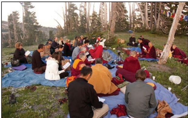
Community Practice on Mount Hood (2009)