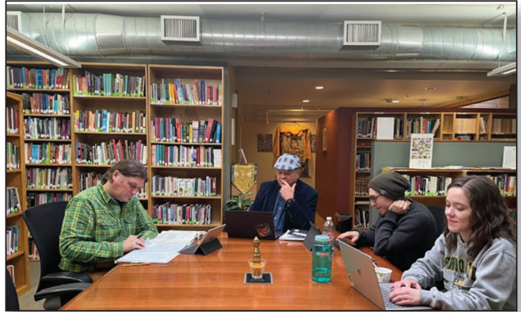
In 2023 the Library relocated to a beautiful new space in a central location on the second floor.

The James A. Blumenthal Library at Maitripa College has an active curatorial management of collection growth, wherein the most relevant and necessary items are purchased in support of degree programs. Titles reviewed favorably in professional journals, subject bibliographies, renowned scholar authors, and requests and recommendations from faculty, staff, and students are determinative factors in acquisitions.