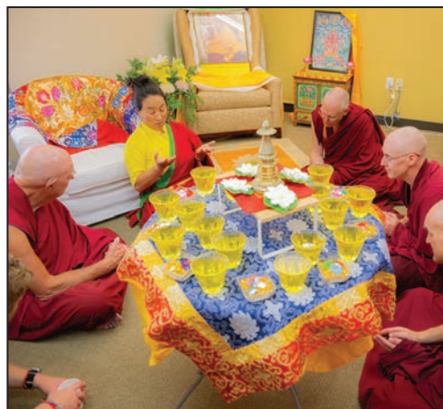
The new “FPMT Gompa” room in use for interviews during Khandrola’s 2023 visit.