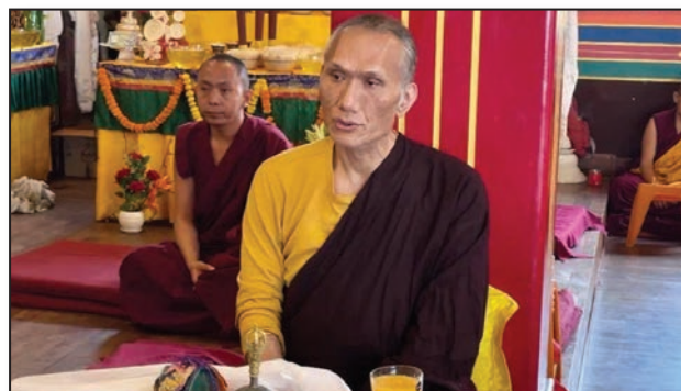
Yangsi Rinpoche at Heruka Lama Chopa at Kopan Monastery, Nepal, April 19, 2023.