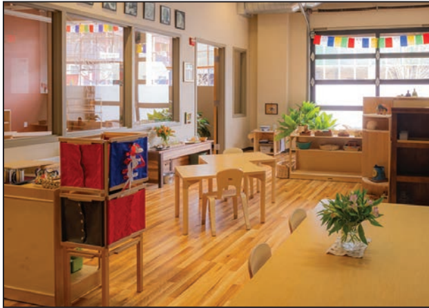
One of the new classroom areas

Maitripa Tara School was founded to bring a unique frame to modern education, to invite children and families to become part of a learning community, and to support them in preparation for life. Our main campus is in the Maitripa College building in Southeast Portland, and we are rapidly developing our program offerings to include further curricula in our neighborhood, and at Tara Farms, a local farm campus in Corbett. Tara School is unique because it offers research-based curricula in an intimate, family-centered learning environment. Inspired by the Tibetan Buddhist tradition as embodied by the Dalai Lama, an education at Maitripa Tara School focuses on the development of a good heart at its core.